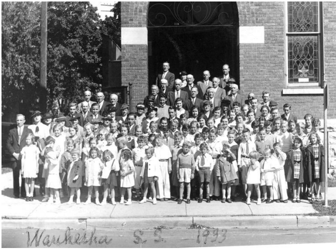
Salem Evangelical Church, Sunday School, 1933 Corner of Barstow St. & South St. in Waukesha