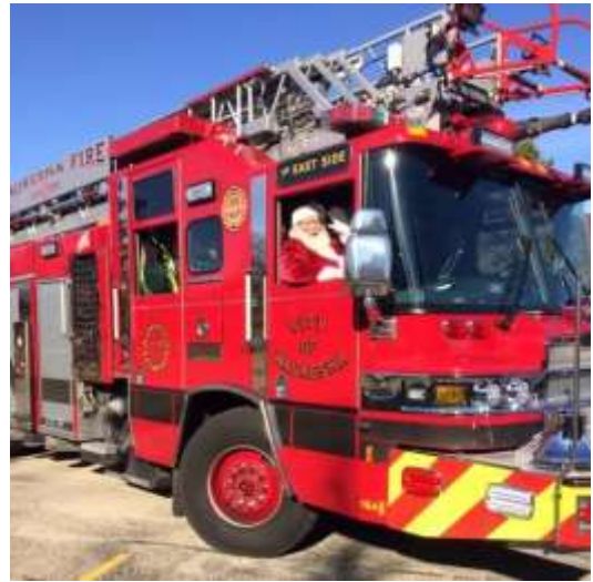
Breakfast with Santa, who arrived in a firetruck!