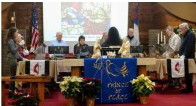
Salem Handbells sounded beautiful!