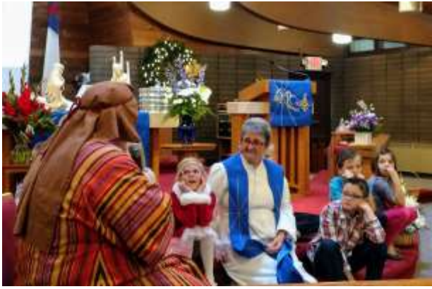
Joseph, Jesus' father, visited Salem