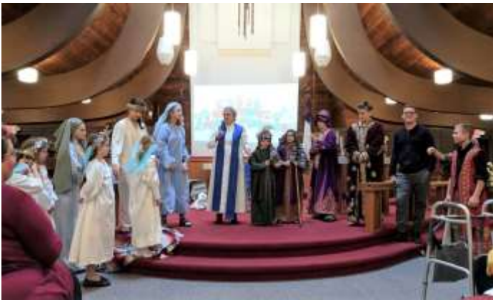
The children & youth presented the Christmas Story