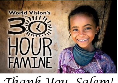
Thank You, Salem!

Our youth would like to thank the congregation and friends for their support of our 30 Hour Famine. We raised over $1,500.00, and World Vision, through grants from the government, will be multiplying our funds four times over. That means we were able to contribute $6000.00!! How incredible is that? God is good. We will be planning our next outing for after Easter. Please watch for details coming out soon.