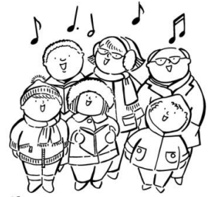
"HERE WE COME R-CAROLING!"