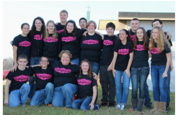
Youth Sunday, Nov. 18