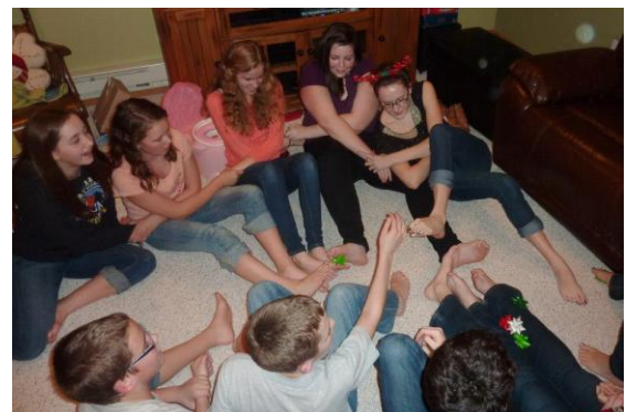
Youth Christmas Party, Dec. 7