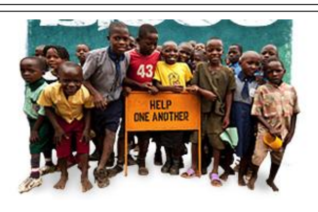
James 2:15-16 "Suppose a brother or sister is without clothes and daily food. If one of you says to him 'Go, I wish you well; keep warm and well fed,' but does nothing about his physical needs, what good is it?"

Don't forget... Food Pantry Sunday at Salem, March 10!