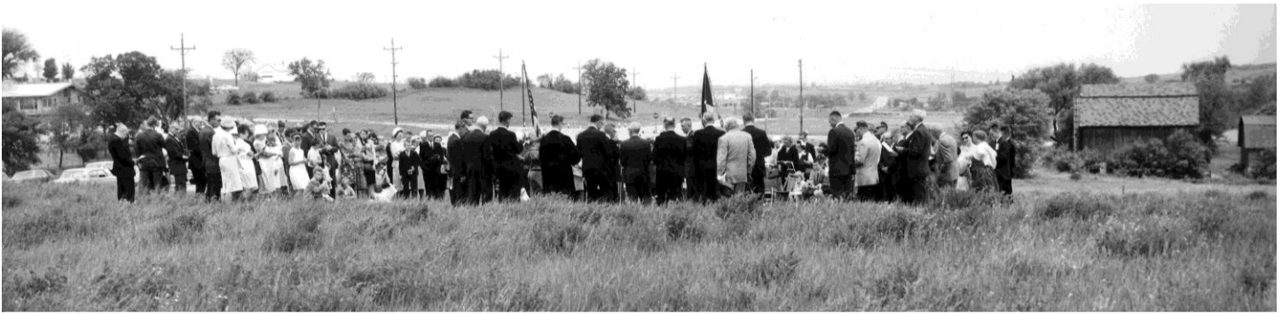
The groundbreaking in 1964 for Salem's current location. Note the stop sign intersection! (view is looking North)