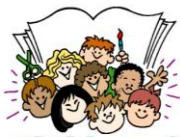
Children & Family Ministries

in memory of a loved one, to celebrate a special day (anniversary, birthday, etc.) or just to add beauty to our sanctuary. Thank you!