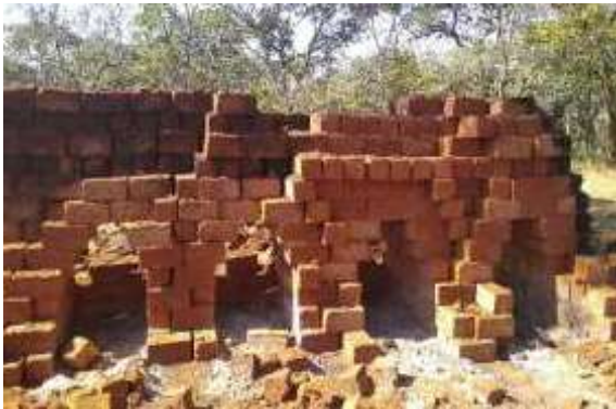
15,000 bricks were molded and fired.