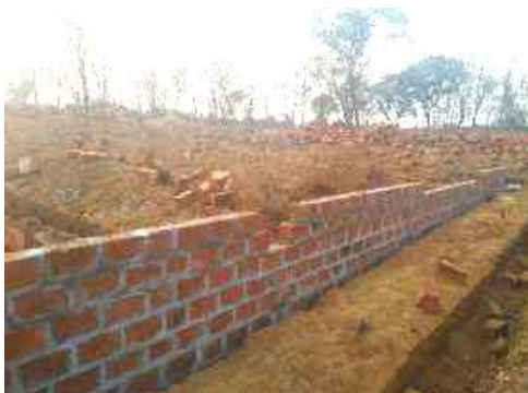
Walls are going up!

This dormitory will provide shelter for people training for the Peace Corps, students from high schools and universities who wish to learn about many different aspects of agriculture, and other guests. Find out all the up to date news about the work at Mujila Falls at: