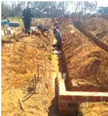
Foundation was laid for the dormitory