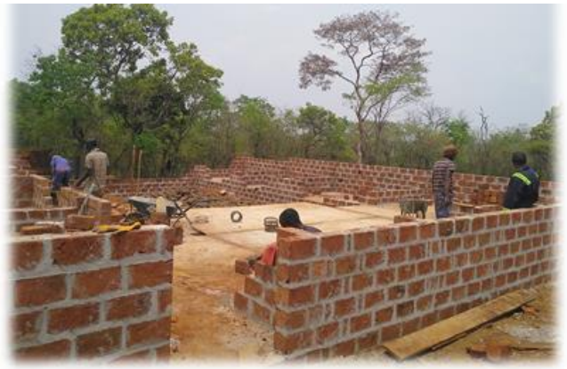
Salem House at Mujila Falls