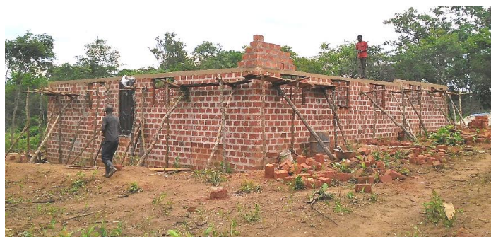
Continued progress on Salem House