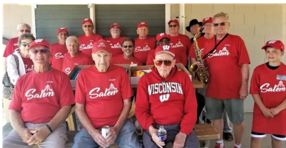
Salem Church Senior Softball Team HEADING TO PLAYOFFS again!