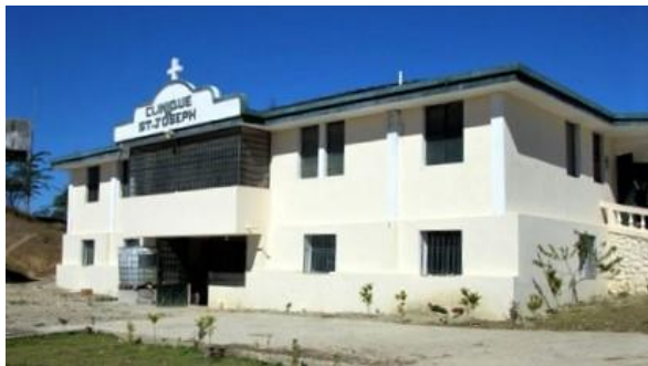
St. Joseph Clinic, Thomassique, Haiti