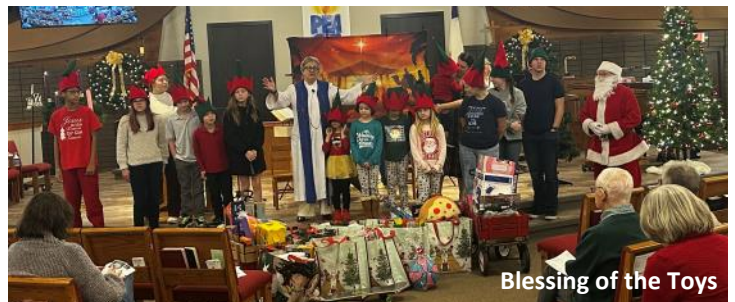
Blessing of the Toys