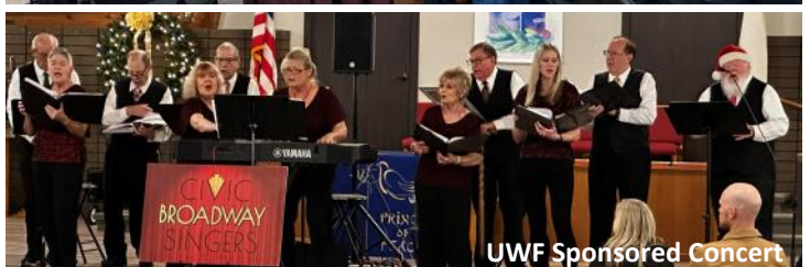
UWF Sponsored Concert