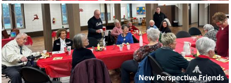
New Perspective Friends