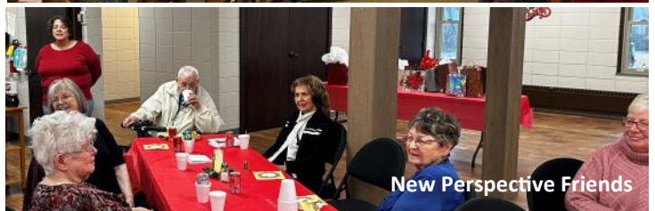
New Perspective Friends